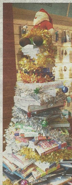
The Christmas tree at Crossword is a book lover's delight!