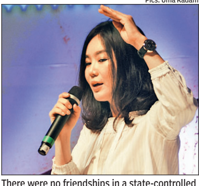
There were no friendships in a state-controlled atmosphere, says Hyeonseo Lee

The repressive North Korean regime's insistence that citizens report against each other in criticism sessions still haunts dissident Hyeonseo Lee. Years after she crossed over to China at the age of 17 and then to South Korea, she still cannot tell her mother she loves her. "I don't know how to say it. We had grown up criticizing, we did not know how to compliment," she said in a session titled 'Escape from Kim' on Saturday at the TOI Litfest. The state-controlled atmosphere was such that there were no friendships and no trust even between spouses. "Once a student told the teacher that his friend suddenly had many new things in his house. The school informed the state. They found a relative had escaped to China and was sending money. The entire family was punished," said Lee.