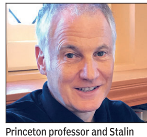
Princeton professor and Stalin biographer Stephen Kotkin

"What's a bigger subject than [Joseph] Stalin?" asked American historian, academic and author Stephen Kotkin during his session on the Soviet tyrant. "A biography of Stalin is a history of the world. He lined-edited novels, he pre-screened all the films, he decided all the foreign policy affecting Europe, Asia, sometimes Africa, the US and Latin America. Moreover, if you are interested in power, this is the gold standard of dictatorship. No one has ever accumulated or exercised more power than Stalin."