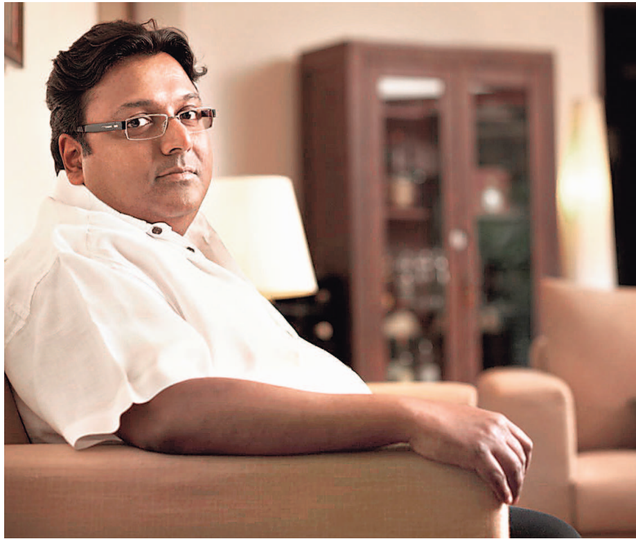
MEETING OF MINDS Ashwin Sanghi; (right) James Patterson

Moreover, given that this was the second book that we collaborated on, the process became even easier because we understood the