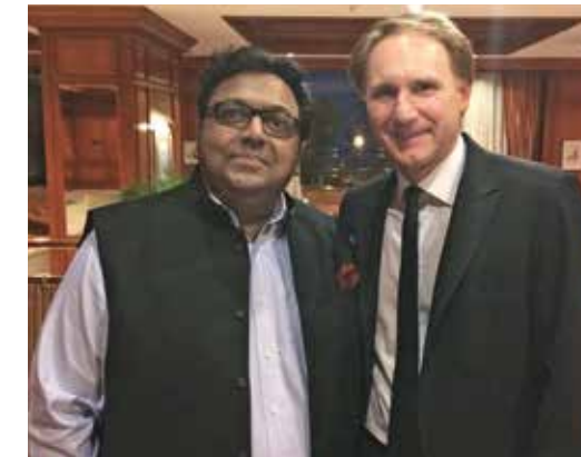
L-R: Sanghi with Dan Brown; James Patterson

I have held the view that God can be defined mathematically as God = Infinity - Knowledge. Whatever part of the infinite universe we cannot understand, we attribute to God. Dan (Brown) calls it 'God of the Gaps'.